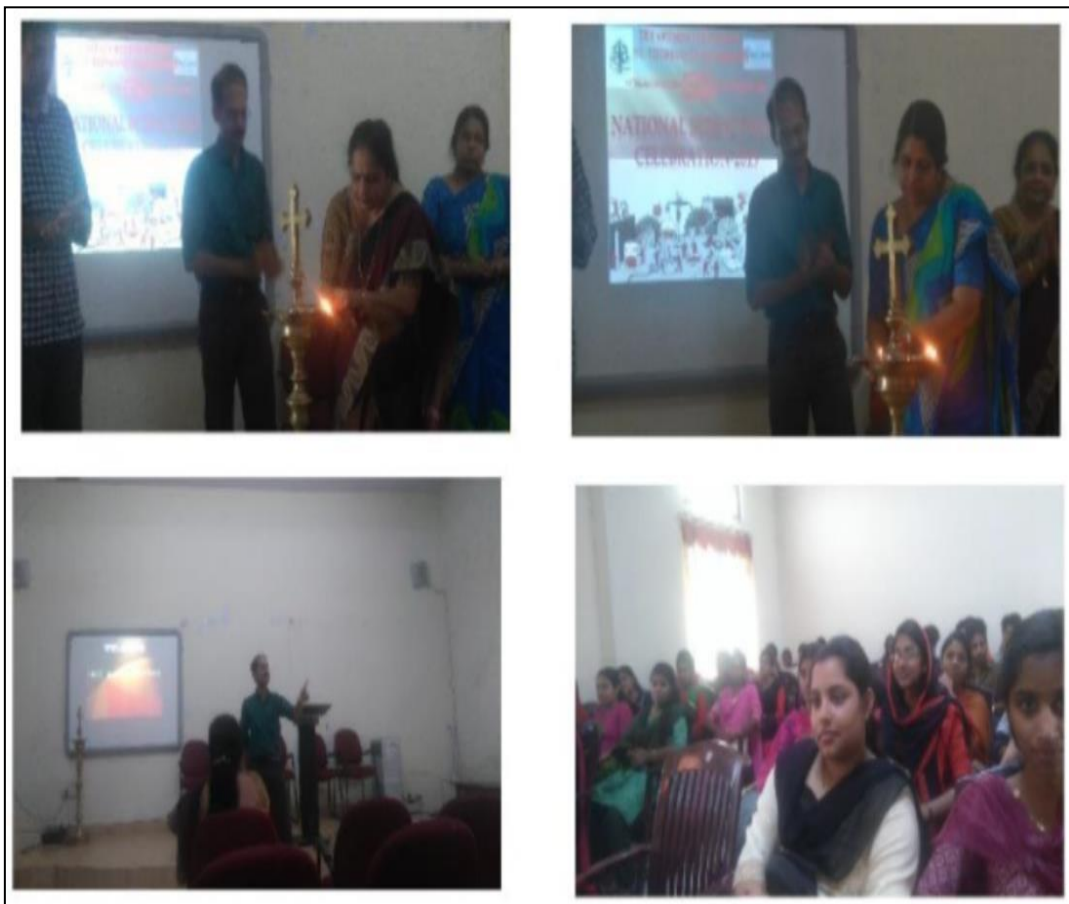
National Science Day 2018- 26, 27 February 2018