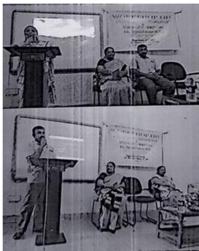
Workshop on Research Methodology