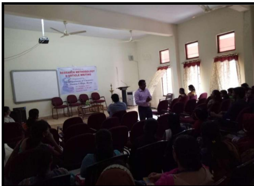
A Workshop on Research Methodology and Article writing