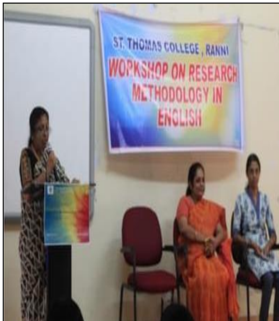
Workshops on Research Methodology in English