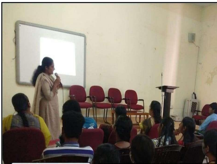
Seminar on Research Methodology