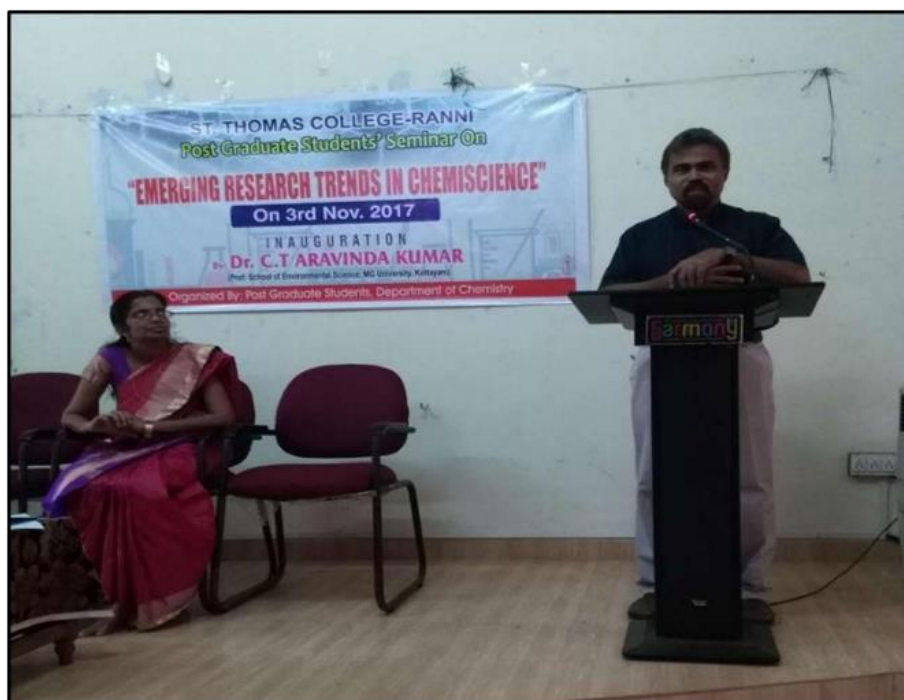
Seminar on “Emerging Trends in Chemiscience”