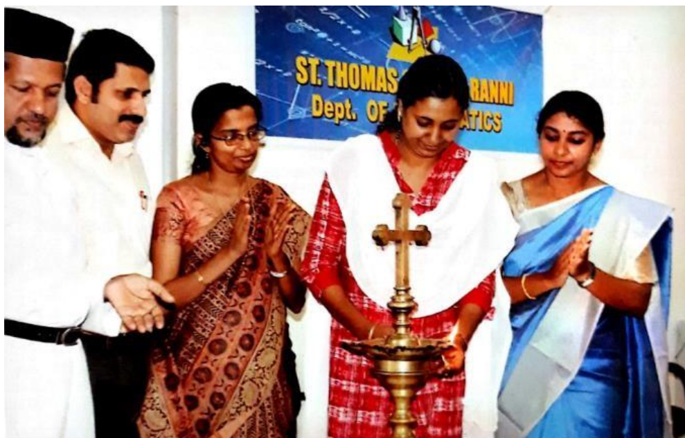
Mathematical talk on Fuzzy Mathematics